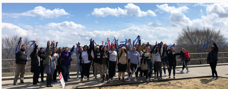
Above: attendees of the Blue Ribbon Walk at Herkimer College hold up their ribbons in the breeze.